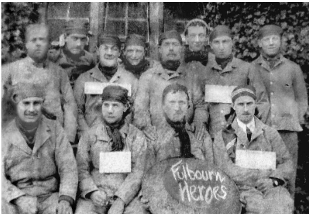
An archive photo of the 'Fulbourn Heroes'... but who/what are they? Do you know?