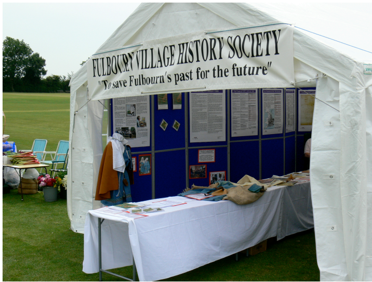
The full display erected and awaiting the Feast opening