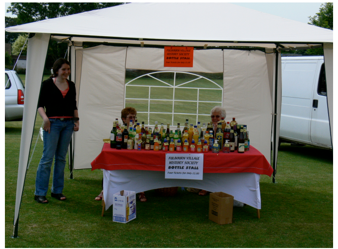
'Ladies with bottle!' The FVHS bottle stall which raised valuable funds stand by for the onslaught.