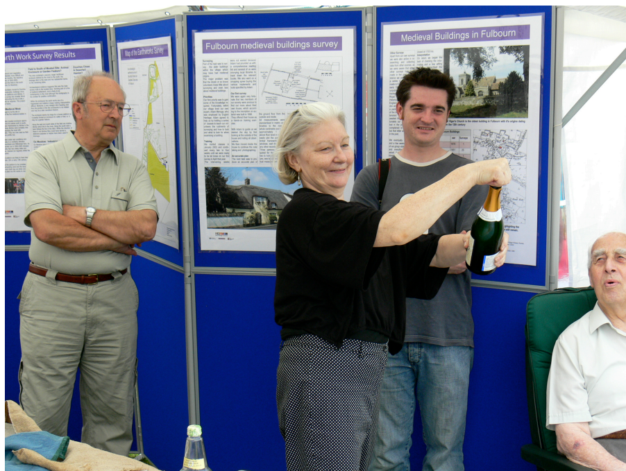
To the incredulity of numerous members, your Secretary demonstrates unexpected bottle handling skills at the celebration.